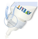
Built-in Airflex Valve